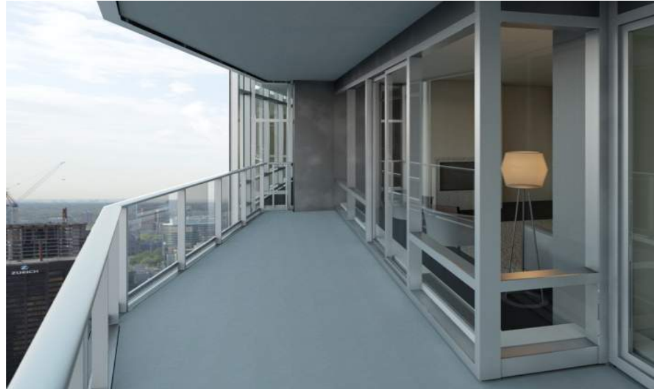
Shorten the days of having to look at your bare concrete balcony or terrace!

These tips will guide you along the path of transforming your balcony or terrace into a favourite place in your home.